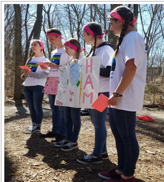
Students at the oral presentation station during the 2016 L.I. Envirothon held at the Usdan Summer Camp for the Arts in Wheatley Heights.

Thank you to our generous sponsors: Covanta, New York Power Authority, Usdan Summer Camp for the Arts, and Nassau County Parks who have provided the funding and/or resources to make this event possible.