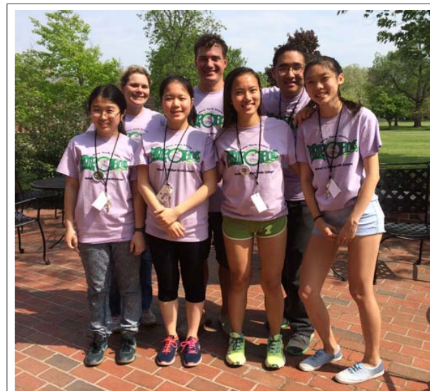
The 2016 Nassau team from Great Neck H.S. South at the NYS Envirothon. They placed fifth overall!

All high schools in Nassau and Suffolk Counties are eligible to participate by registering one or two 5-member teams. All students from the two top scoring teams (one from Nassau & one from Suffolk) each receive a $500 scholarship, and paid registration and transportation to compete in the New York State Envirothon in May. All participating students and their teachers receive an event memento and recognition for their participation. Registration deadline is April 1st.