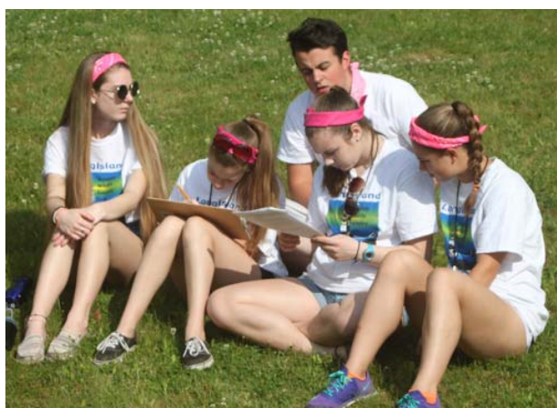
The 2016 Suffolk team from Sachem North H.S. competing at the NYS Envirothon in Geneva, N.Y.